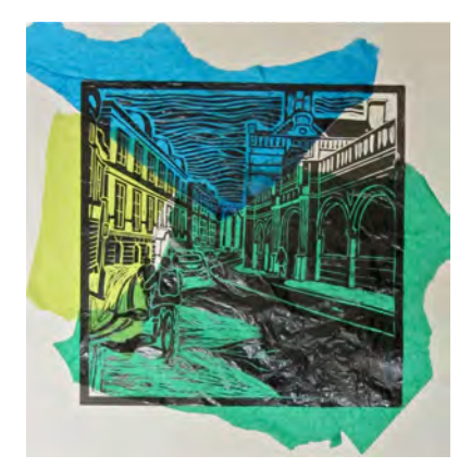
Lino with Chine Collé

"Prints look great! What you offer is such great value and so well run. We plan to make our visit a regular one."