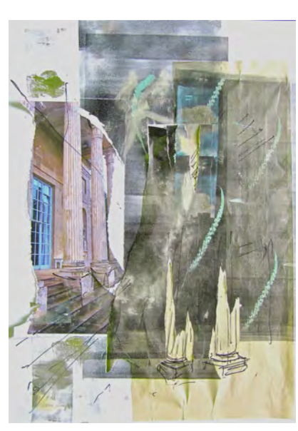
Collaged Hybrid Print