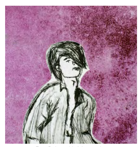
Dry Point with Monoprint

"Thank you so much, this has been an incredible experience! It has been great to be able to use such high quality materials and to receive such useful advice."