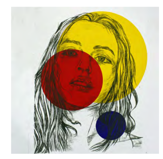
Dry Point with Chine Collé

Saffron Walden County High School - Essex